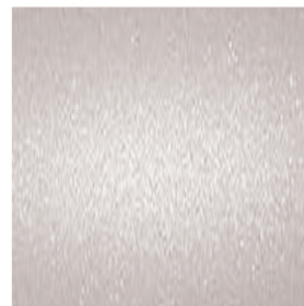
334 Sparkle Etched Glass