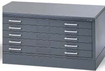
Hamilton Regular Series file with cap, 5-drawer file and flush base