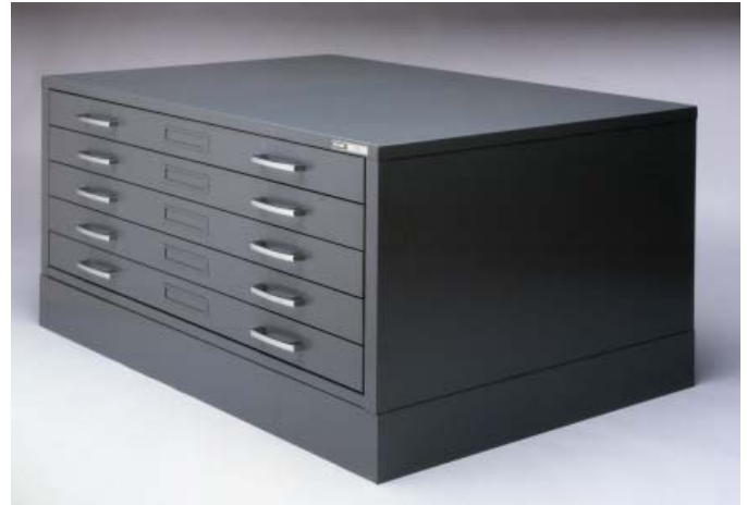
5-drawer Museum File with flush base