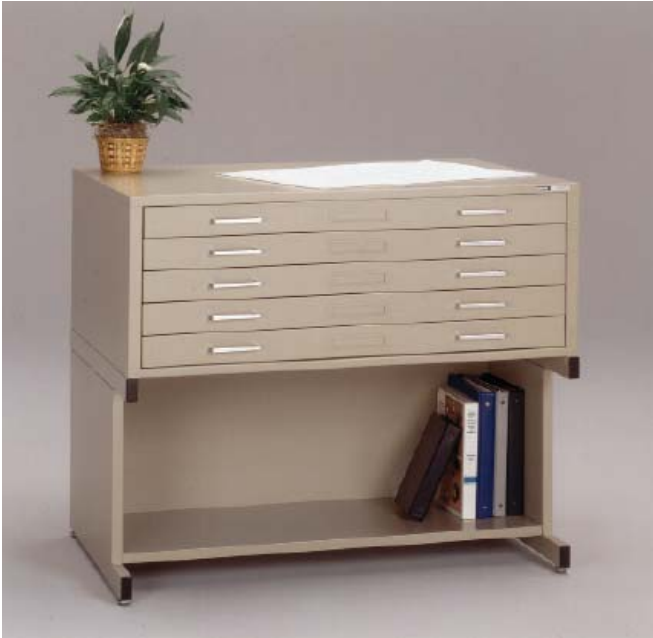
5-drawer C-File on 20" high base

Whether the need is for active or archival storage of drawings, C-Files are the perfect fit! Structurally, they provide the greatest protection of any plan file on the market.