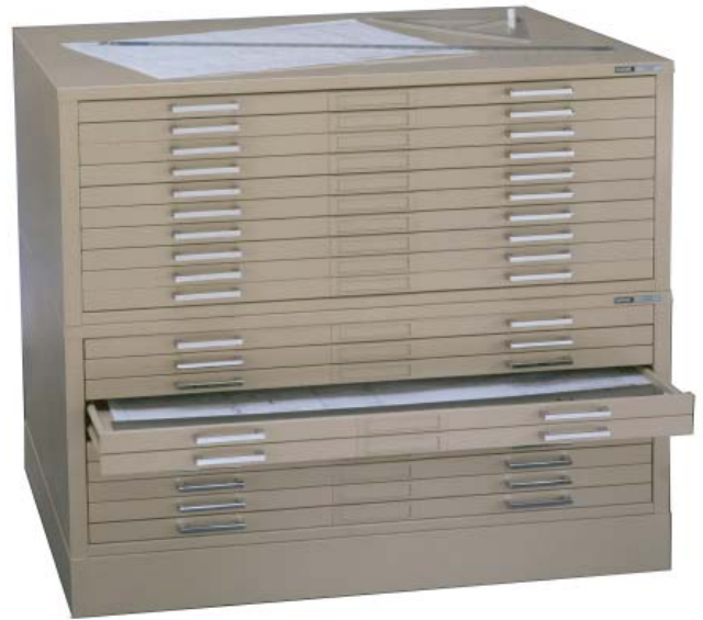
Double stacked 10-drawer C-File on flush base