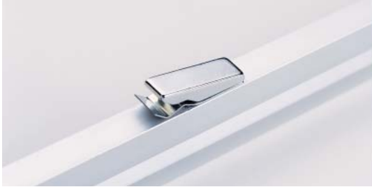
Spring-loaded metal mounting clips