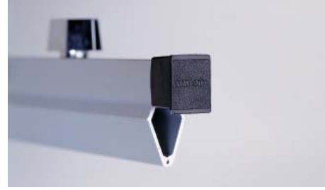
Close-up of clamp