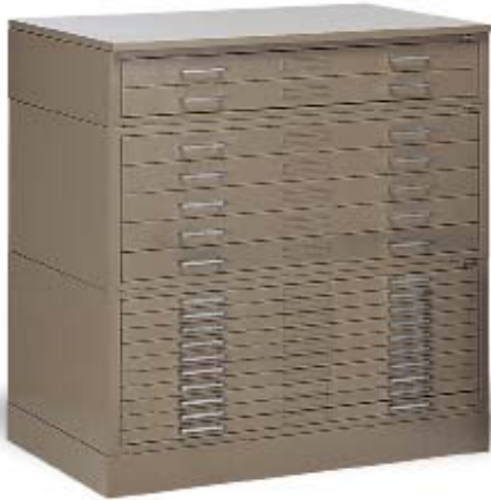
Mayline interlocking Plan File with cap, 2-drawer file, 5-drawer file, 10-drawer file and flush base

Both series of interlocking files are classic steel files recommended for storage of tracings, prints, charts, maps, or semi-active or archival reference drawings. The interlocking design and heavy-duty reinforced corner posts allow for ease of stacking up to five high. The front plan depressor and rear hood keep documents flat and orderly.