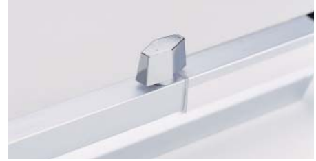
Metal wing knob