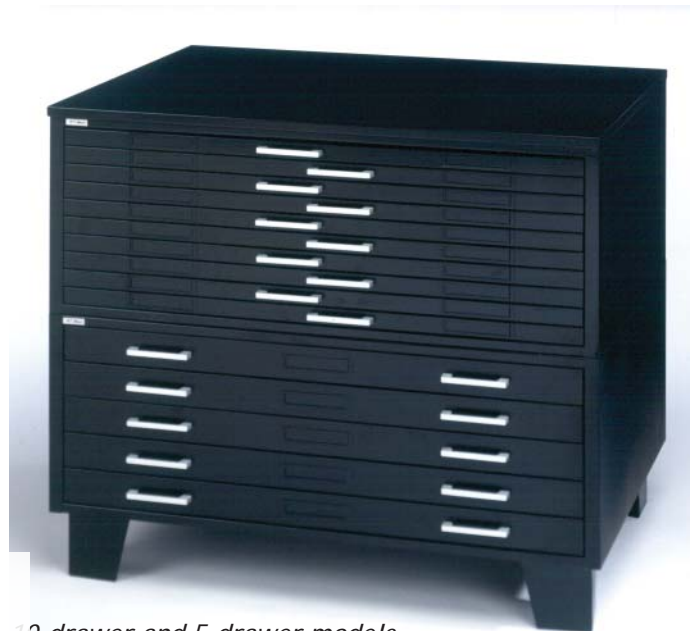
10-drawer and 5-drawer models interlocked on a 6" base