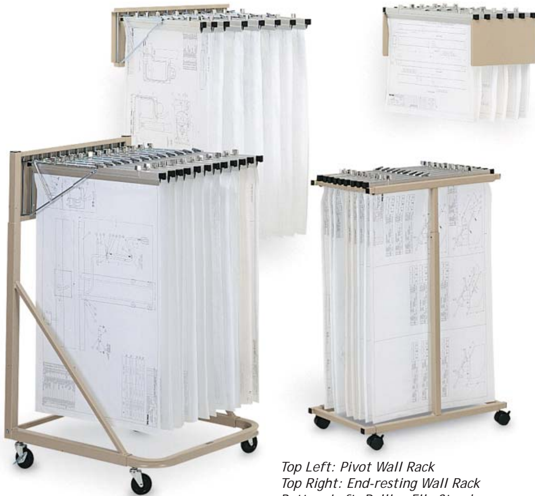
Top Left: Pivot Wall Rack Top Right: End-resting Wall Rack Bottom Left: Rolling File Stand Bottom Right: Expandable Plan Center

Mayline Vertical Clamp Files are the ideal choice for economical, mobile filing of active documents. Binders have an easy-to-use clamp that grips sheets securely without punching or stapling. Mayline clamps and pivot hangers are designed to be interchangeable with the systems of other manufacturers for easy integration. Perfect for engineering and construction applications!